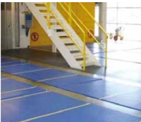
Photo above. Existing system, marking of belt edges will improve operator safety.

A worker based on the corrugator down-stacker takeaway zone regularly walks onto the take away belts from the side area thus clear bright marking of the belt edge position is a critical part of being continually safety focused.