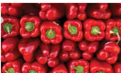
Agriculture & Horticulture