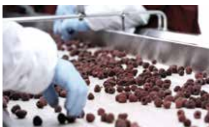
Export & OEM