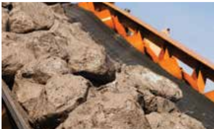
Quarry & Mining

We work with a diverse range of companies, across multiple industry sectors including: